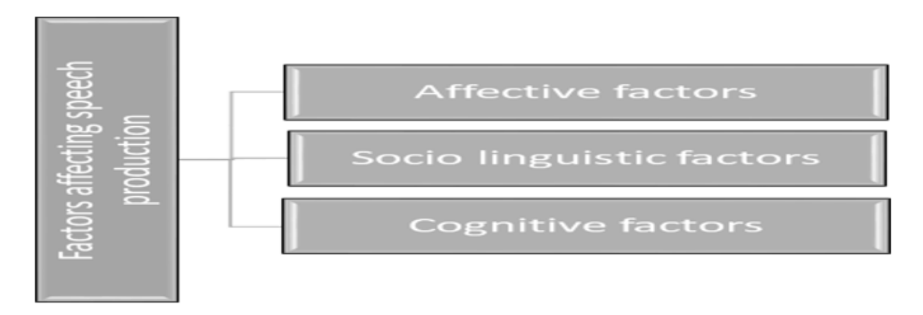
Figure 2. Summary of the interview data

Interview data and the analysis of the data are summarized as follows. The above data presents what the participants have suggested at the interview phase of the study. The interview data suggest that it is not only cognitive factors but also socio-linguistic and affective factors that affect candidates in their L2 speech production.