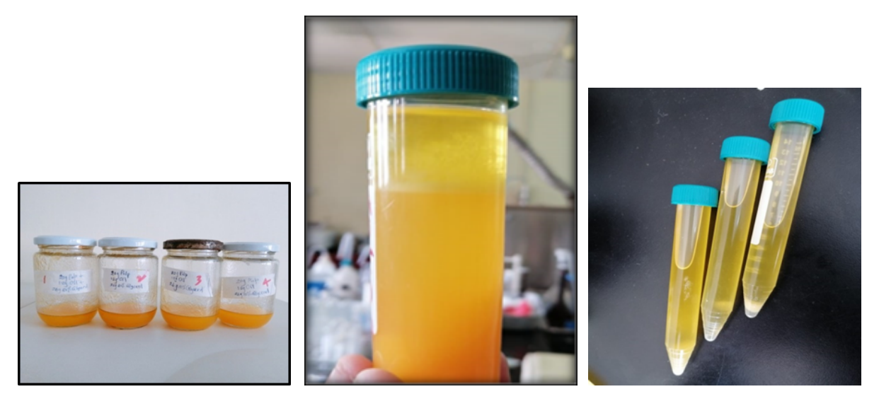
Figure 1. (a: The extraction mixture containing macerated pulp and organic solvents in 1:10 (dw:v) ratio b: The extraction mixture after being centrifuged c: Pigment oil

Oil-soluble carotenoids were successfully extracted (Fig.1a & b) in oil and the oil containing carotenoids was yellow in colour (Fig. 1 c), in comparison to the colour less cold-pressed virgin coconut oil. Between the liquid soaps produced with either pigment oil or colour less virgin