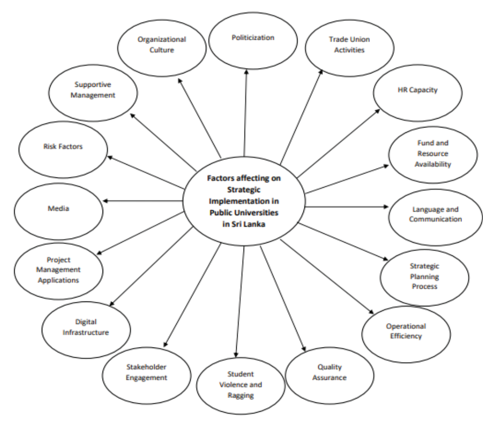
Figure 2: Expanded thematic model

sources and reports), and the interviews (university staff), the thematic model is expanded, as shown in Figure 2.